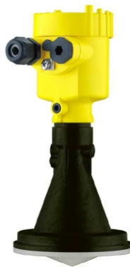
Radar level sensor set RSH-03